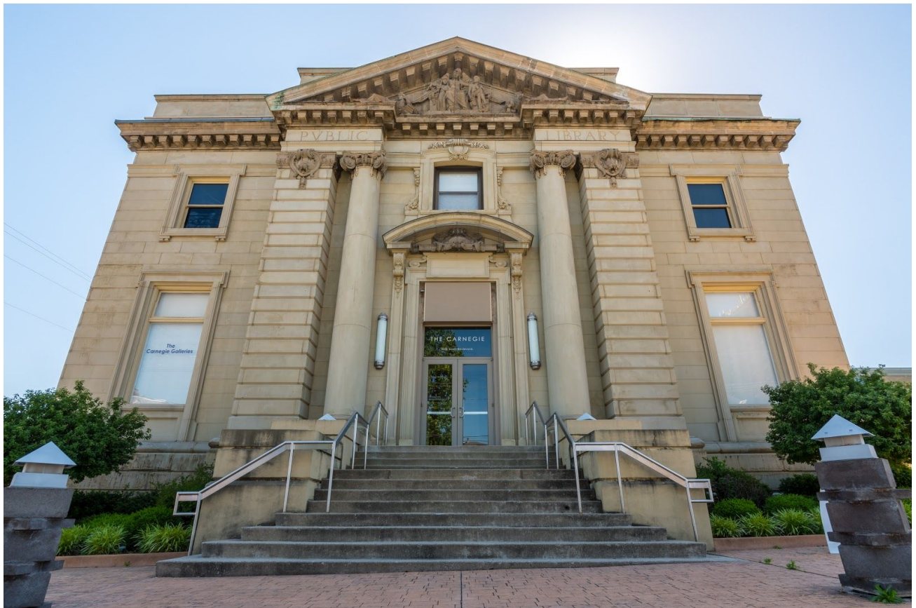
The Carnegie in Kentucky (pictured) will host the FotoFocus Symposium and Juried Exhibition this fall

Accompanies Fall Symposium on Tech's Impact on Photography and Politics