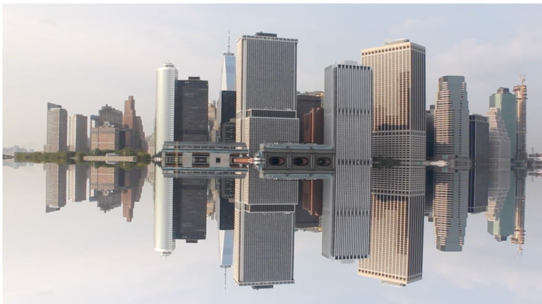
Valerie Sullivan Fuchs, Floating City , 2018. Video, 3:00 mins. Variable.

Valerie Sullivan Fuchs makes kaleidoscopic, multiplied worlds based off our own reality and genetics. A video of an eerily duplicated Manhattan that she created during her 2018 artist residency on Governor’s Island will be screened in the exhibition.