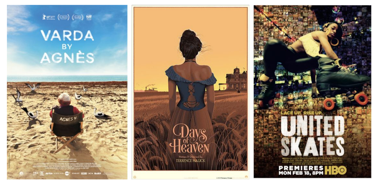
L-R: Varda by Agnès (2019), Days of Heaven (1978), United Skates (2018)

Details of the remaining six months' programming to be announced.