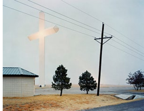
Taiyo Onorato & Nico Krebs, Biggest Cross in Texas , 2005 from The Great Unreal . 39 x 50 inches. C-Print, mounted and framed.

Taiyo Onorato & Nico Krebs (Swiss, both b. 1979) work collaboratively in photography, video, and installation. The first large museum exhibition of the Swiss duo in the US, Taiyo Onorato & Nico Krebs: The One-Eyed Thief at the Contemporary Arts Center comprises disparate yet interrelated bodies of work. The Great Unreal , based on road trips made in the US between 2005 and 2008, deals with the subject of America through the iconic action of the road trip. Onorato & Krebs' work opens a fertile dialogue on the subject of artistic collaboration as well as the "expansion" of photography as an artistic medium. Though much of their work is photographic, and is informed by the history of photography, the artists' engagement with other media - film, sculpture, sound art - opens organically into other vistas of historical modernity and contemporary life.