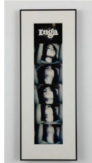
John Waters, Inga #3 , 1994. 6 C-prints. Each image: 5x7 inches. Framed 37 ¼ x 13 ¾ inches. Edition 2 of 8. Signed, titled and numbered in ink (verso)

8:00pm This Filthy World Performance by John Waters , American filmmaker, collector, visual artist, actor and writer