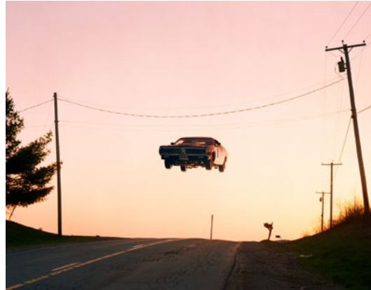
Nicolas Provost, Stardust , 2010. 20 min.

As a complement to Screenings (Lightborne Studios, Oct. 8-12), Stills expands the dialogue between the still and the moving image from the perspective of still photography. Featuring works by thirteen contemporary artists, Stills explores the idea of the photograph as an isolated instant in time. Approaches range from the analysis of a single moment to sequences of images suggesting cinematic narrative. While certain works come close to replicating the naturalism of the moving image, all stop short of that experience for a more studied view of our ever-changing world.