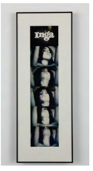
John Waters, Inga #3 , 1994. 6 C-prints. Each image: 5x7 inches. Framed 37 ¼ x 13 ¾ inches. Edition 2 of 8. Signed, titled and numbered in ink (verso)

Special Guest Speaker: John Waters , American filmmaker, collector, visual artist, actor and writer, performing This Filthy World .