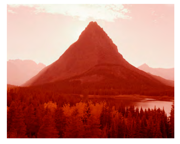
David Benjamin Sherry, Crown of the Continent , Montana, 2011, 2012, traditional color darkroom photograph, 40 x 50 inches.

David Benjamin Sherry: Western Romance September 26 – November 1, 2014 1500 Elm Street, Over-the-Rhine in Cincinnati