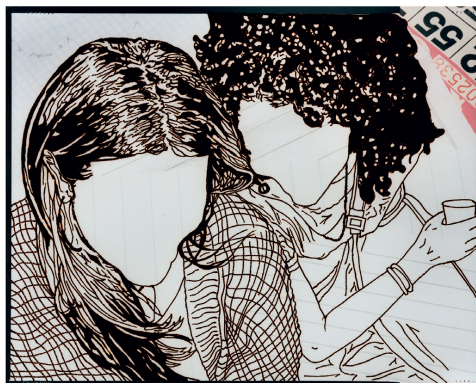
JOWAHARA ALSAUD, CLIP, 2010, FROM THE SERIES OUT OF LINE, COURTESY THE ARTIST AND ATRR GALLERY