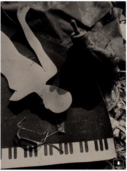
Vilém Reichmann, Begegnung in Trummern, 1946.