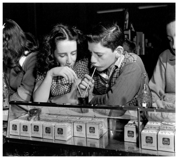
Sharing a Soda, Vermont, 1946.

exhibitions | events | columns | reviews | news | resources photographmag.com