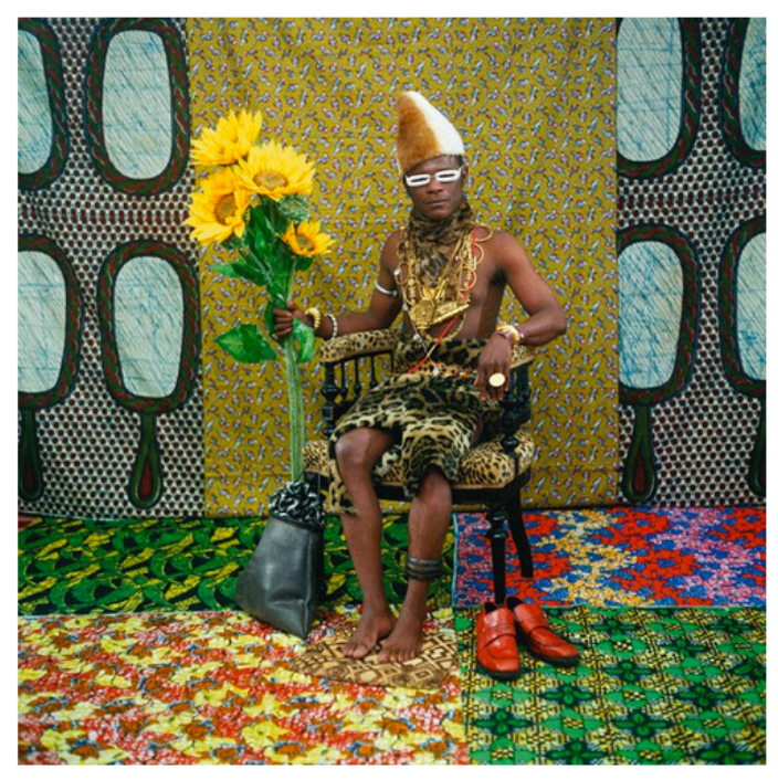
Samuel Fosso, Le chef qui a vendu l'Afrique aux colons, 1997. Courtesy Walther Collection, @Samuel Fosso