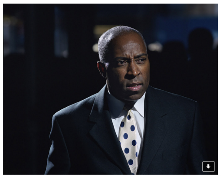
Philip-Lorca diCorcia, Head #1, 2001.

FotoFocus Biennial 2014 opens October 8 in Cincinnati and runs through November 1. Centered around Washington Park, the monthlong celebration of photography includes exhibitions, lectures, panel discussions, and screenings, including Eyes on the Street at the Cincinnati Art Museum.