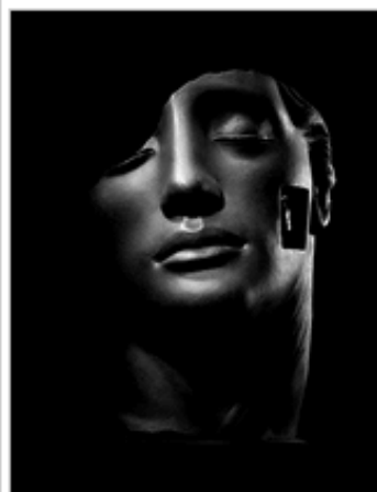
Contini Gallery has represented the Pietrasanta--based artist for 25 years.

ContiniArtUK announces that celebrated master sculptor Igor Mitoraj dies at age 70