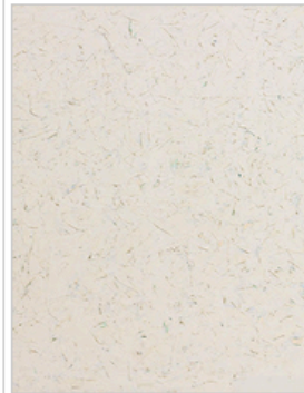
Robert Ryman, Untitled (detail), signed and dated 61; signed four times and dated 61 three times on the overturned left edge, oil on canvas, 48 3/4 x 48 3/4 in. 123.7 x 123.7 cm. Est. $15/20 million.

PARIS.- For the first time in Europe, the Centre Pompidou is to present a comprehensive retrospective of the work of Frank Gehry, one of the great figures of contemporary architecture. Known all over the world for his buildings, many of which have attained iconic status, Frank Gehry has revolutionised architecture's aesthetics, its social and cultural role, and its relationship to the city. It was in Los Angeles, in the early 1960s, that Gehry opened his own office as an architect. There he engaged with the California art scene, becoming friends with artists such as Ed Ruscha, Richard Serra, Claes Oldenburg, Larry Bell, and Ron Davis. His encounter with the works of Robert Rauschenberg and Jasper Johns would open the way to a transformation of his practice as an architect, for which his own, now world-famous, house at Santa Monica would serve as a manifesto. Frank Gehry's work has since then been based on the interrogation ... More