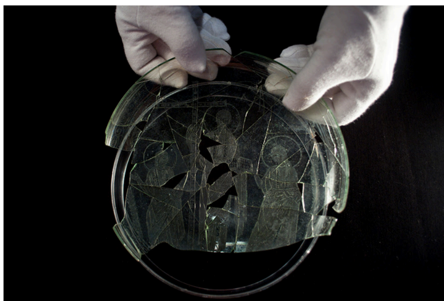
Image of a Christ without a beard, short hair and wearing a toga unearthed in Spain

A museum employee presents a glass dish, bearing the engraved image of a Christ without a beard, short hair and wearing a toga, exposed in the Museum of Archaeology of Linares near Jaen on October 7, 2014. Dating from the 4th century bc this unusual picture, one of the oldest of Christianity, was discovered in Spain and took three years for archaeologists who regularly discovered fragments in the ruins of a building for religious worship in Castulo to piece together almost all of the 22 centimeter diameter plate.