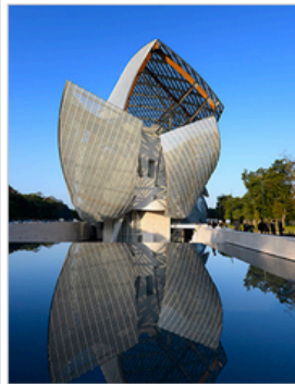
The new building of the Louis Vuitton Foundation for Creation modern and contemporary arts centre, designed by architect Frank Gehry.

MUMBAI.- Christie's announces that it will hold its second auction in Mumbai on Thursday 11th of December 2014. This follows the success of the inaugural auction in India held a year ago. Christie's is the only international auction house to conduct annual sales in India, demonstrating its continued commitment to the art market in the country. The sale will take place at The Taj Mahal Palace in Mumbai with a pre-sale viewing, open to the public, from 9 to 11 December. A strong selection of works will be also publicly previewed in New Delhi at The Taj Mahal Hotel from 28 to 30 November. The inaugural sale in 2013 established the highest price for a work of art ever sold in India* and the sale total of INR 96,59,37,500 (USD$15,455,000) doubled pre-sale expectations with 98% of the lots sold, a testament to the strength of the market and the interest in India's cultural heritage from the national and international collecting co ... More