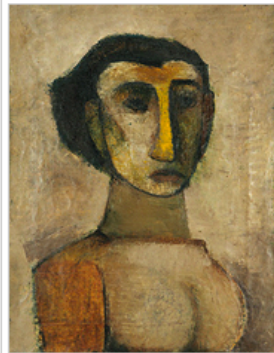
Tyeb Mehta, Girl in Love, signed and dated 'Tyebi 57' (upper right), oil on canvas, 23 1/4 x 17 1/4 in. (59.1 x 43.8 cm.). Painted in 1957. INR 70,00,000 – 90,00,000.

MUMBAI.- Christie's announces that it will hold its second auction in Mumbai on Thursday 11th of December 2014. This follows the success of the inaugural auction in India held a year ago. Christie's is the only international auction house to conduct annual sales in India, demonstrating its continued commitment to the art market in the country. The sale will take place at The Taj Mahal Palace in Mumbai with a pre-sale viewing, open to the public, from 9 to 11 December. A strong selection of works will be also publicly previewed in New Delhi at The Taj Mahal Hotel from 28 to 30 November. The inaugural sale in 2013 established the highest price for a work of art ever sold in India* and the sale total of INR 96,59,37,500 (USD$15,455,000) doubled pre-sale expectations with 98% of the lots sold, a testament to the strength of the market and the interest in India's cultural heritage from the national and international collecting co ... More