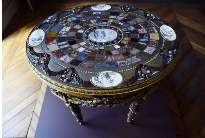
PARIS.- A picture shows the Tischen Table (1779), for which the Louvre museum has launched a fundraising campaign towards the general public for its acquisition, on October 7, 2014, in Paris. Considered a masterpiece of goldsmithery, the piece of furniture was created to commemorate a treaty between Prussia and Austria.