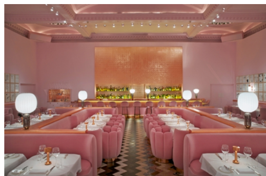
Sketch, London, Gallery dining room.

The 50-year-old district in Beijing, studded with decommissioned military buildings, has now been converted into a popular arts community district. With a number of galleries, cafés, and shops, the 798 District is a definite hot spot for all artsy types in Beijing.