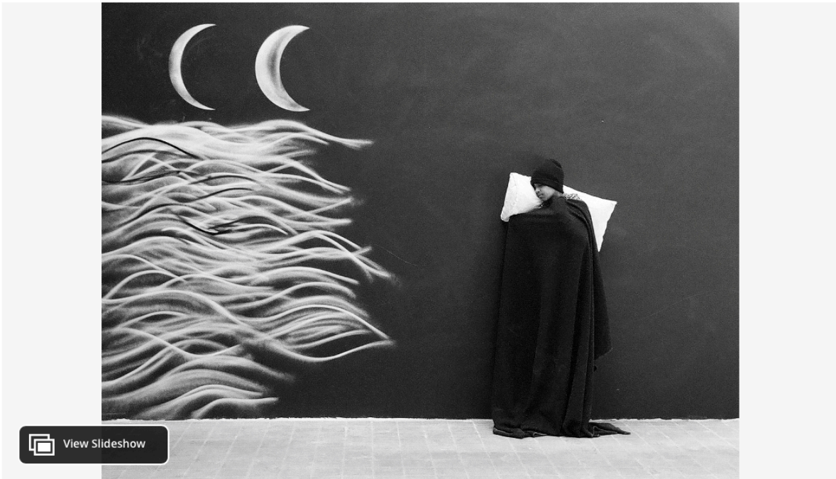
Robin Rhode The Moon is Asleep , 2016 Super 8mm film transferred to digital HD, duration: 1 minute, 50 seconds, edition of 5