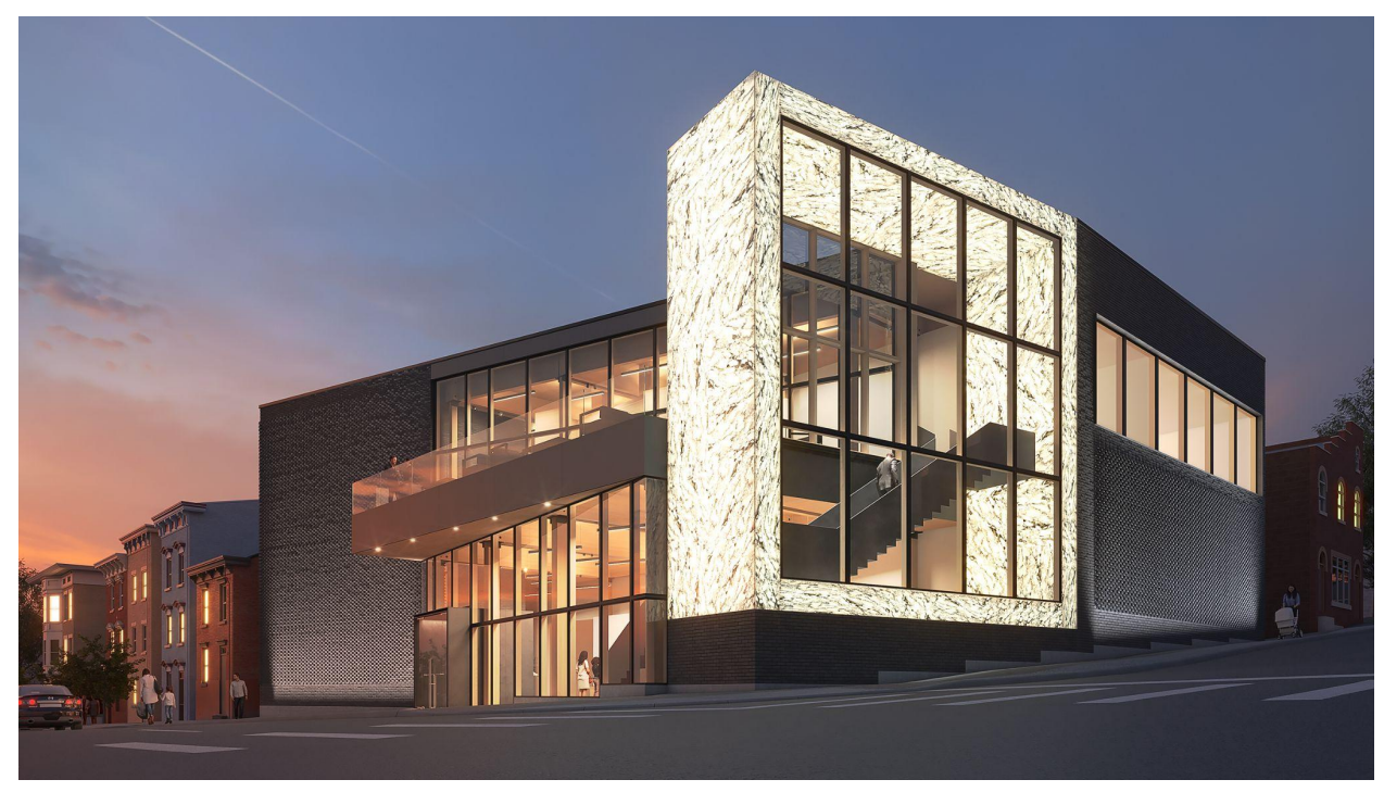
Rendering of FotoFocus Center. Courtesy of JOSE GARCIA DESIGN + CONSTRUCTION

Inaugural FotoFocus Center Marks Major New Chapter for the Nonprofit Dedicated to Championing Photography and Lens-Based Art