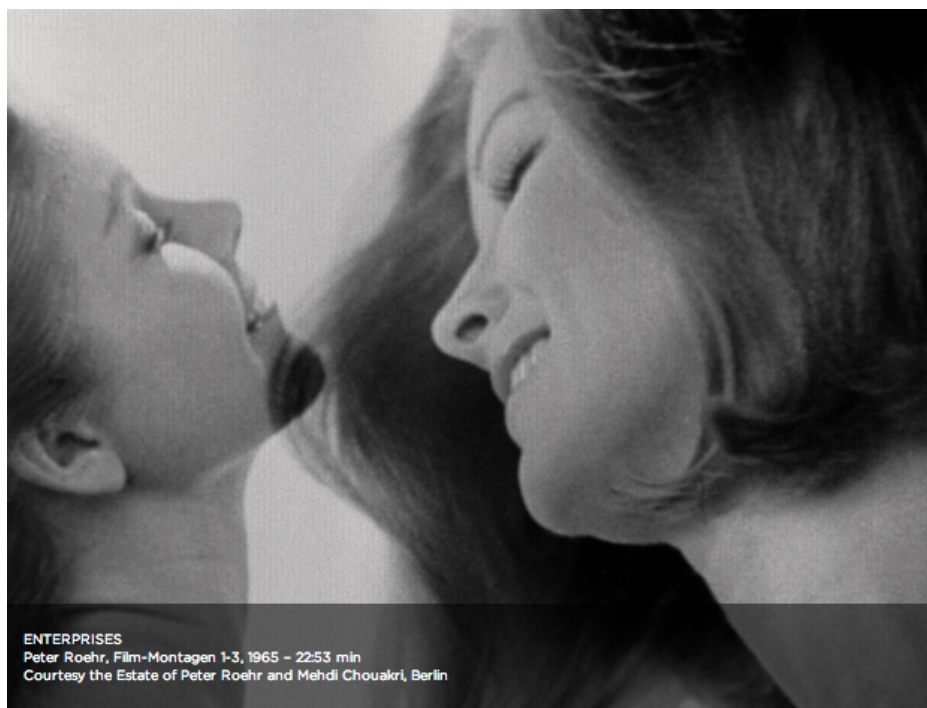
ENTERPRISES Peter Roehr, Film-Montagen 1-3 , 1965 – 22:53 min