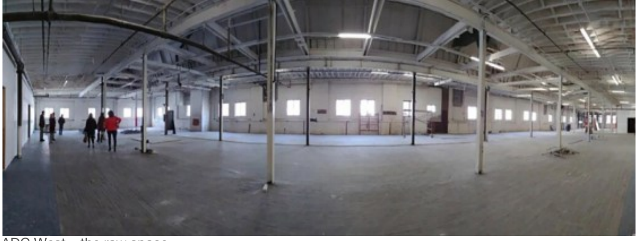
ADC West - the raw space

Art Design Consultants, ADC West Open House | Noon-5 p.m. Opportunity to safely explore extensive new West End space housing this corporate and residential art consultancy. View artwork by more than 150 talented artists featured in their annual Blink Art Resource publication. Reception: 5-8 p.m. (RSVP required)