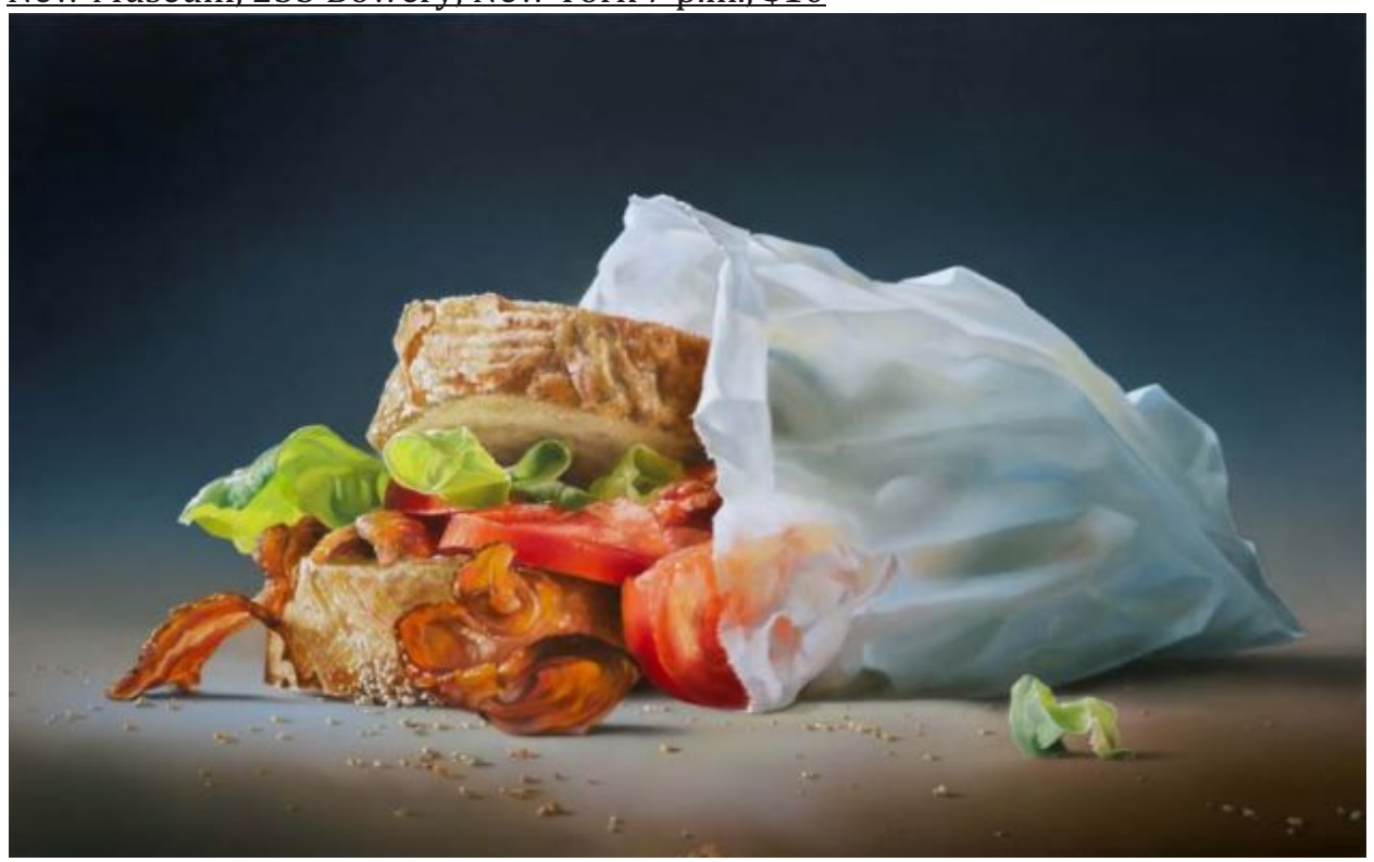
Tjalf Sparnaay, BLT Sandwich, 2015. (Courtesy Bernaducci Meisel Gallery)

New Museum, 235 Bowery, New York 7 p.m., $10