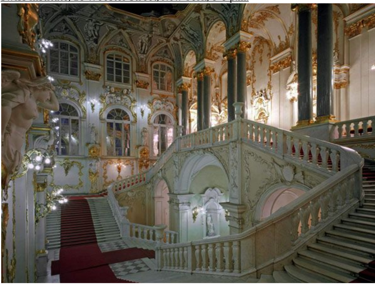
Ambassador Staircase.

Swiss Institute, 18 Wooster Street, New York, 6-8 p.m.