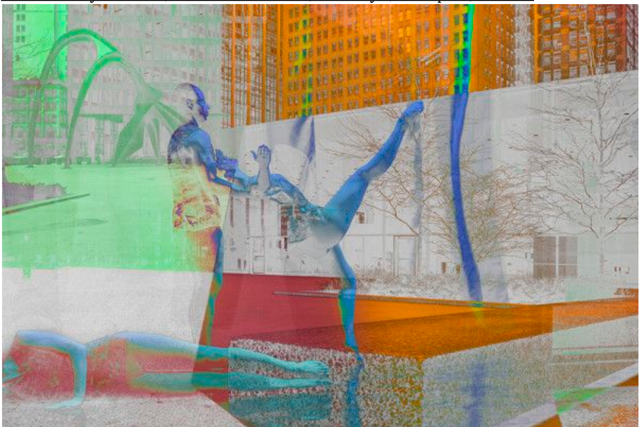
James Welling, 4940, 2015.

BAM Harvey Theater, 651 Fulton Street, Brooklyn, 7:30 p.m., $25-50