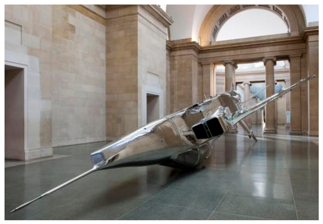
Fiona Banner, Harrier, 2010.