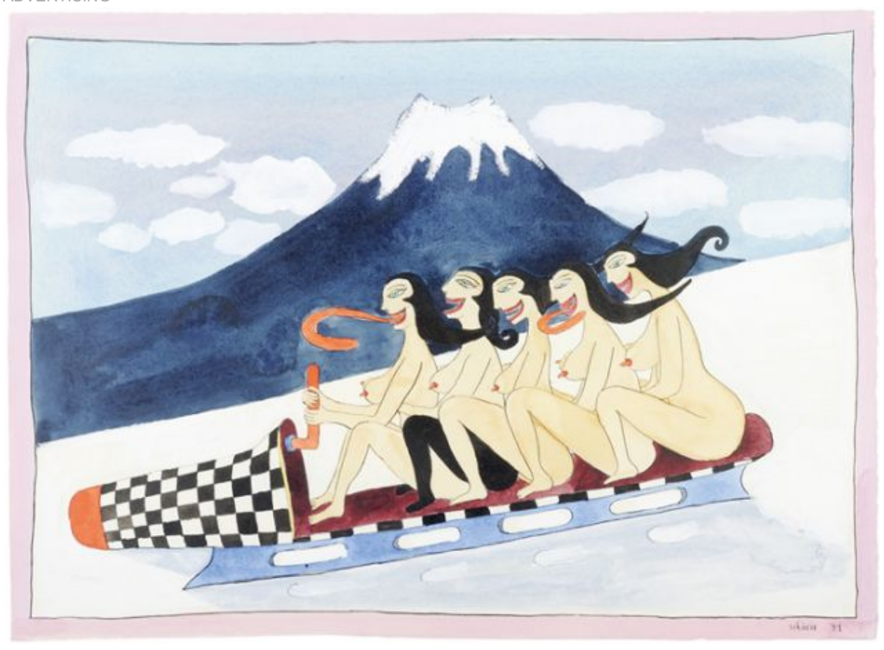
Hans Schärer, Untitled (Schlittenfahrt) , 1971. (Photo: Courtesy Galerie Anton Meier © Erben Werk Hans Schärer / ProLitteris, Zurich 2015)