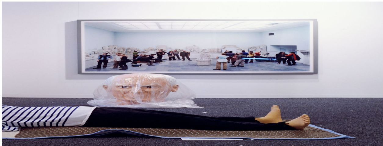
Big (adjusted to fit). 2002/2003/2016. Adhesive wall material, dimensions variable. The Museum of Modern Art, New York. Acquired through the generosity of The Modern Women's Fund and The Contemporary Arts Council. © 2016 Louise Lawler

There is more to an image than what meets the eye.