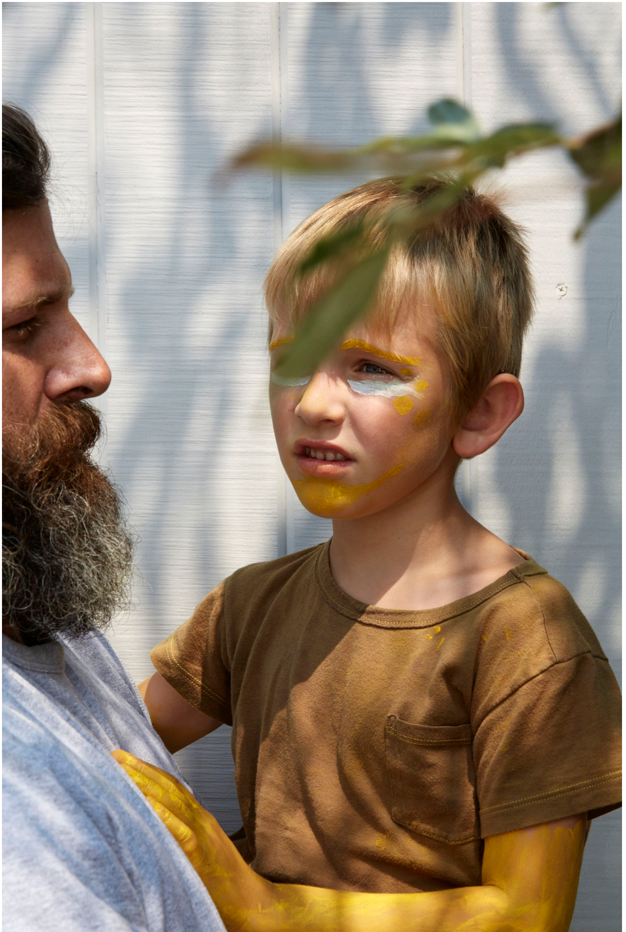
Me and Auggie , 2015. Dye sublimation print on aluminum, 45 x 30 inches