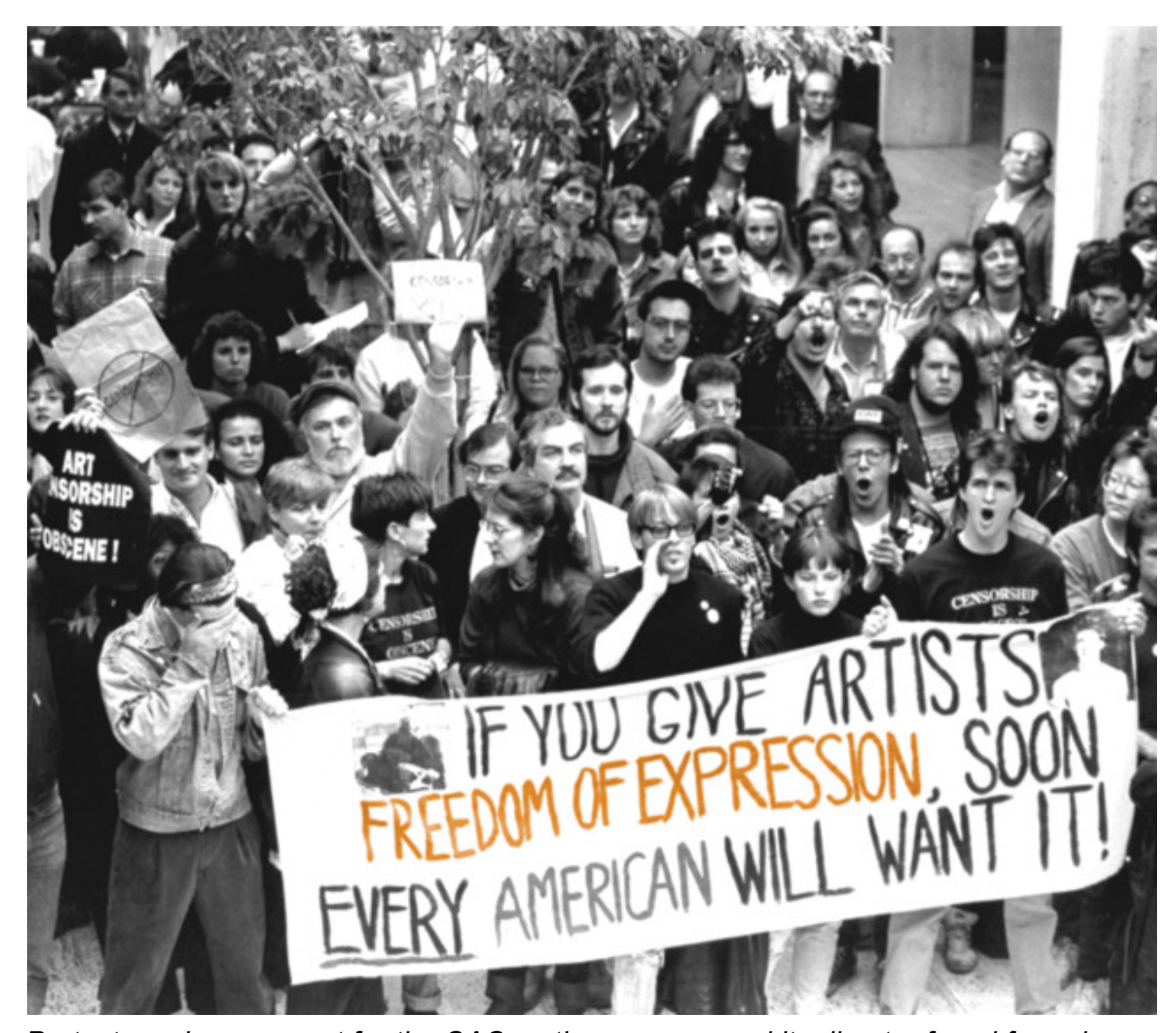
Protestors show support for the CAC as the museum and its director faced formal obscenity charges.