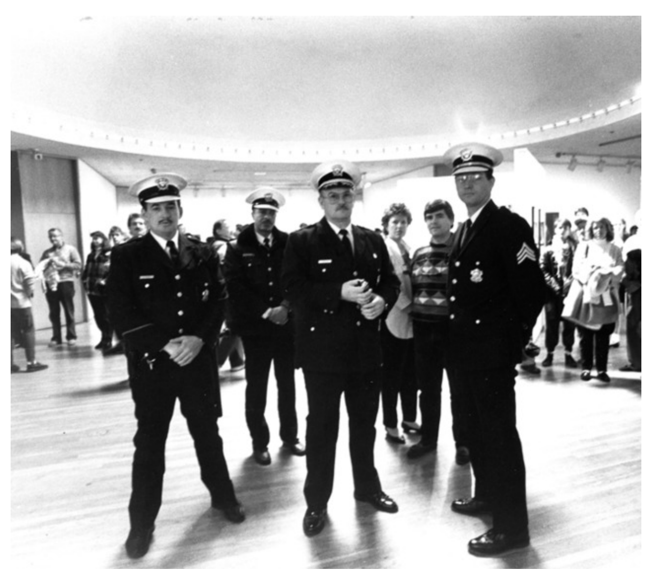
Cincinnati police were an ominous presence at the 1990 opening of the Mapplethorpe exhibit.

This prosecution was pursued despite the fact the show seemed constitutionally protected on the face of it — it had serious artistic value because it was organized by an arm of an Ivy League university and had already been shown in other art museums. Also, the attendance seemed to show that "community values" accepted Mapplethorpe's work as art: 81,000 saw the exhibit during its run; a then-record 4,000 came to the preview.