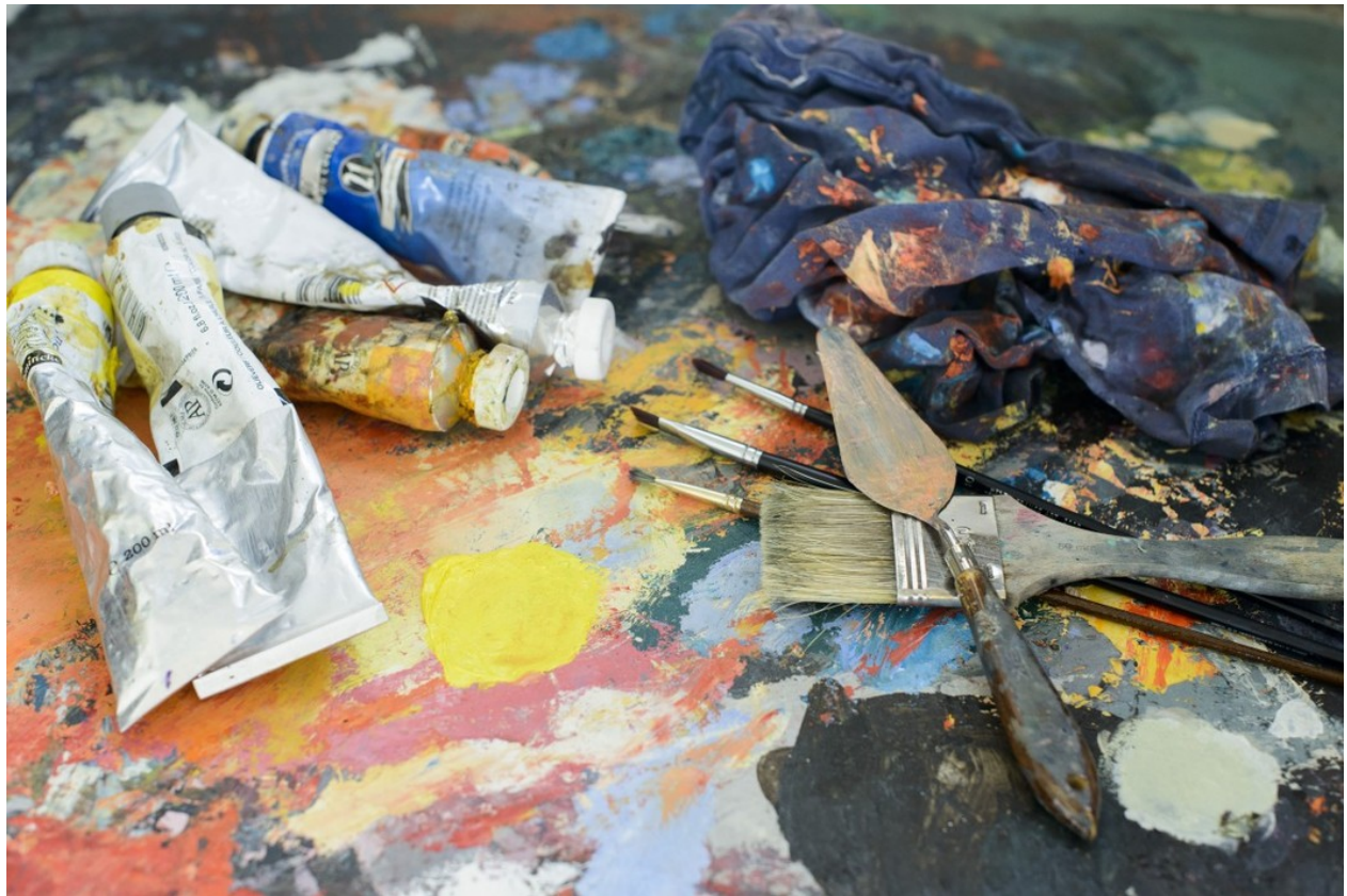
An artist's studio.

FotoFocus Biennial: Originally scheduled for October 2020, the next FotoFocus will take place in October 2022.