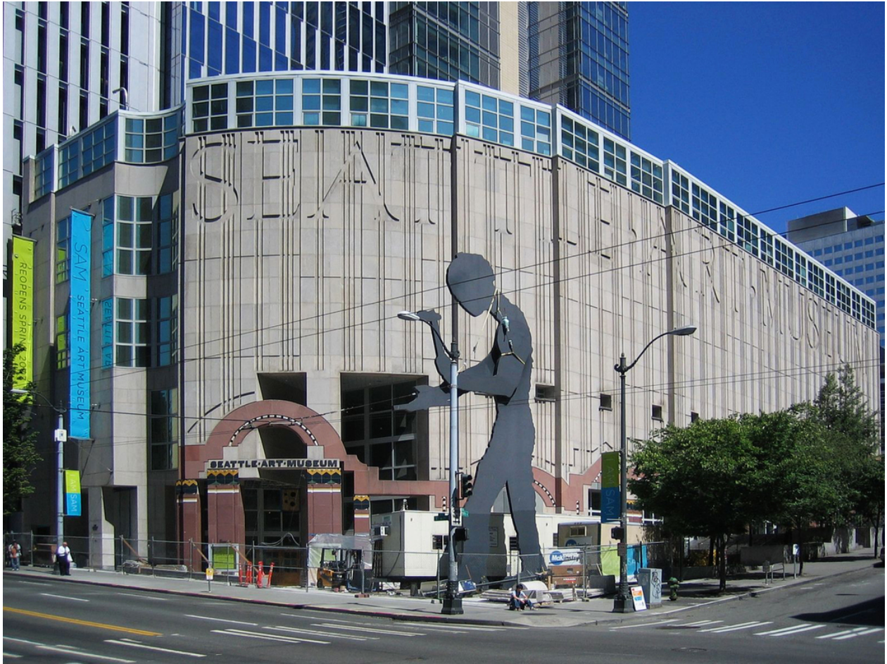
Seattle Art Museum.