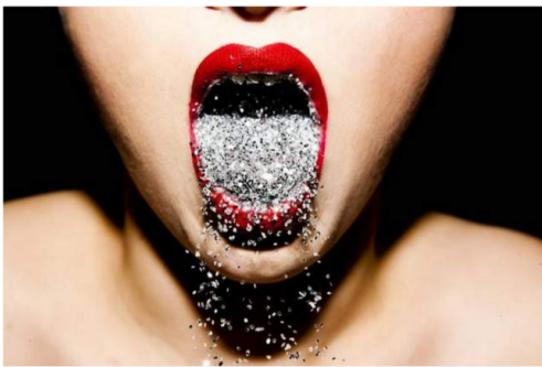
Shields' edgy, arresting work can capture an explosion of paint or a mouthful of glitter spilling out.