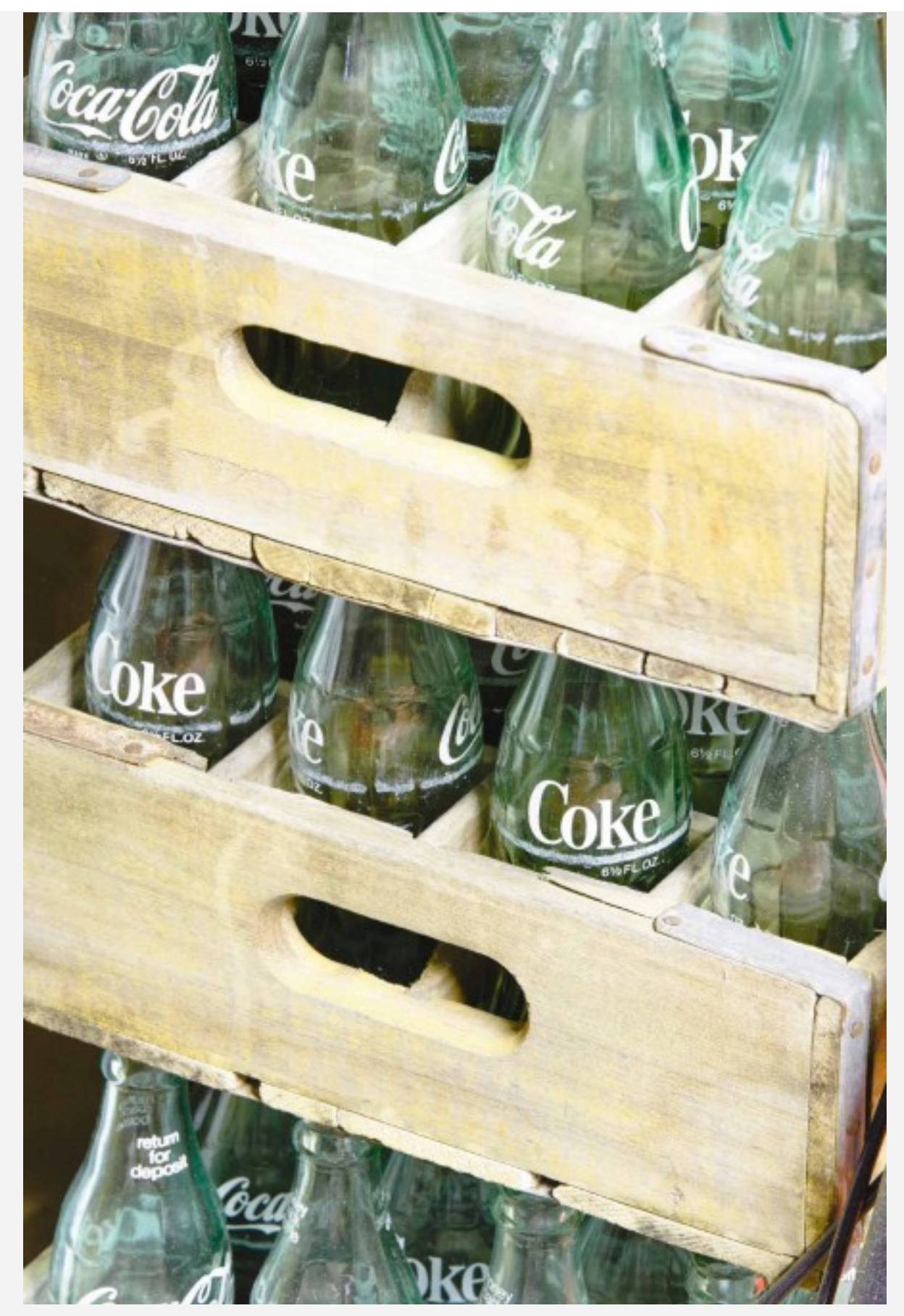
Roe Etheridge, "Coke Bottles", 2015, Dye sublimation print on aluminum, 45 x 30 inches