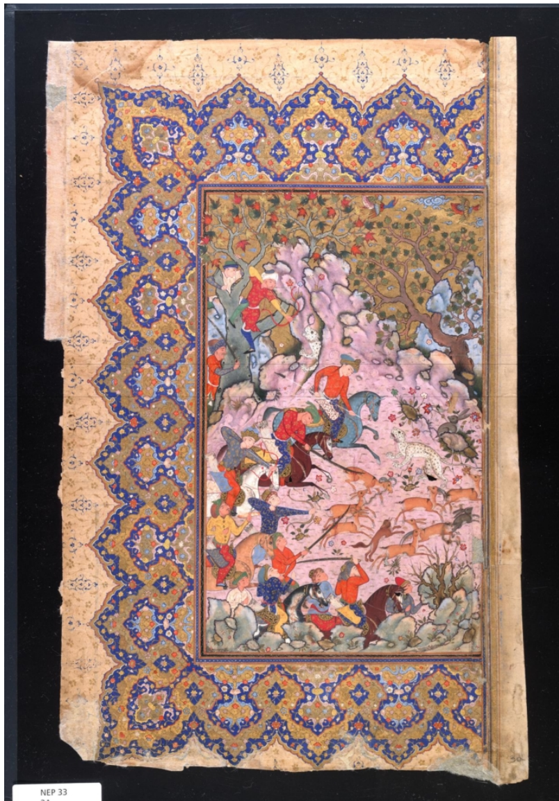
From Khamsah. / خمسه by Nizāmī Ganjavī, 1140 or 1141-1202 or 1203 نظامی گنجوی، (Philadelphia, University of Pennsylvania, University of Pennsylvania Museum of Archaeology and Anthropology)

According to a survey by Americans for the Arts and Artist Relief , 95% of US artists have lost income due to the COVID-19 pandemic.