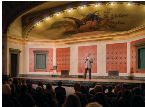
John Waters performing This Filthy World, Oct 11, 2014 at Memorial Hall as part of the FotoFocus Biennial 2014.