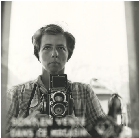
Vivian Maier, Self-portrait, 1959.