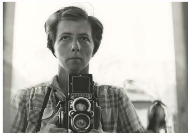
A self-portrait of Vivan Maier.

• LA-based Douglas Kirkland was a photographer for Look and Life magazines in their heydays, mostly known for his pictures of celebrities. He has been a photographer on the sets of more than 150 films, including "The Sound of Music," "Butch Cassidy and the Sundance Kid," "Saturday Night Fever" and "Titanic." He'll discuss his 60 years in photography and sign books Oct. 2 at Cincinnati Art Museum's Fath Auditorium, 6-8 p.m. Free. 953 Eden Park Dr.