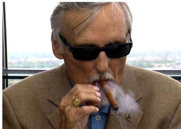
Screenings: Dennis Hopper in "Stardust."