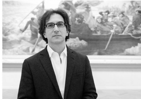
Jeff L. Rosenheim will deliver a keynote address on photography in Memorial Hall on Oct. 10.

ticket. General admission seats available with $25 Flash and $50 Zoom passport tickets. Doors open at 6:30. Speaker begins at 8.