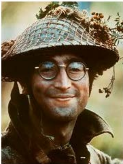
John Lennon, photographed by Douglas Kirkland in 1966 on the set of the movie "How I Won The War."