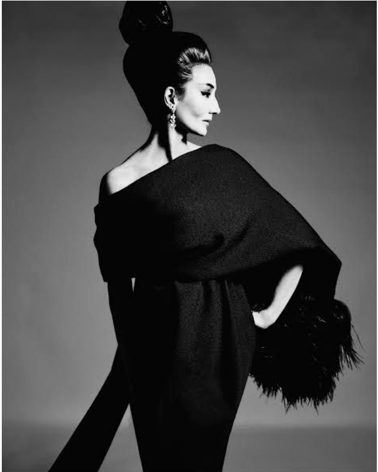
Jacqueline de Ribes in Yves Saint Laurent, 1962.

Rizzoli Bookstore, 1133 Broadway, New York, 6-7:30 p.m.