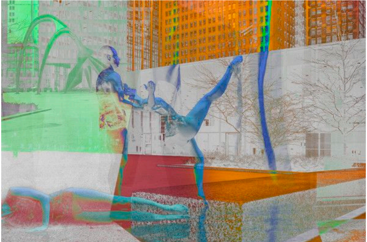
James Welling, 4940, 2015.

BAM Harvey Theater, 651 Fulton Street, Brooklyn, 7:30 p.m., $25-50