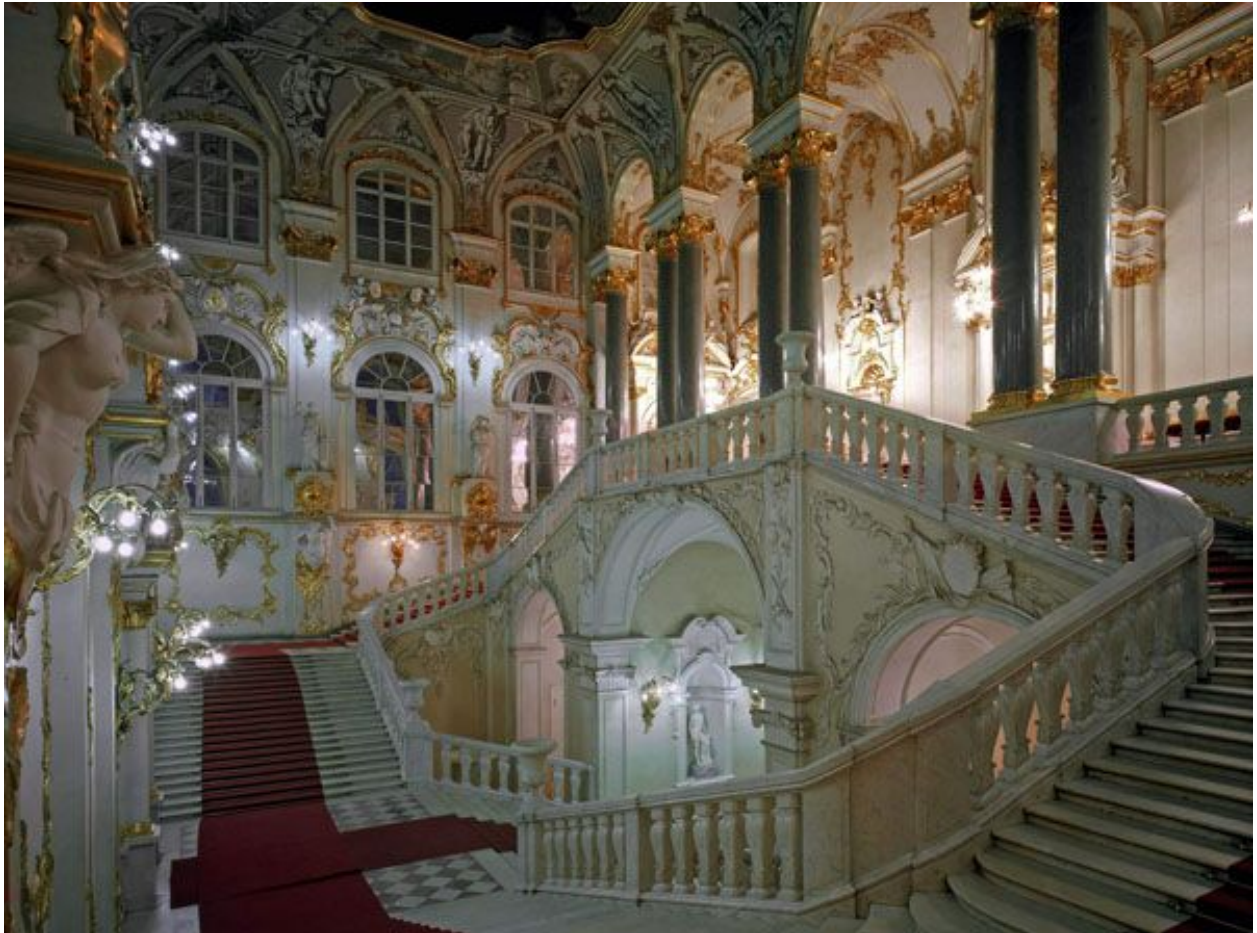
Ambassador Staircase. © The State Hermitage Museum, 2014. Photo by Eugene Sinayaver

Swiss Institute, 18 Wooster Street, New York, 6-8 p.m.