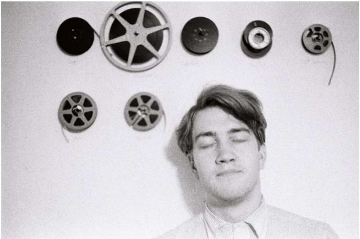
David Lynch With Film Reels, by C. K. Williams

Metropolitan Museum of Art, 1000 Fifth Avenue, New York, 10 a.m.–5:30 p.m., free with museum admission