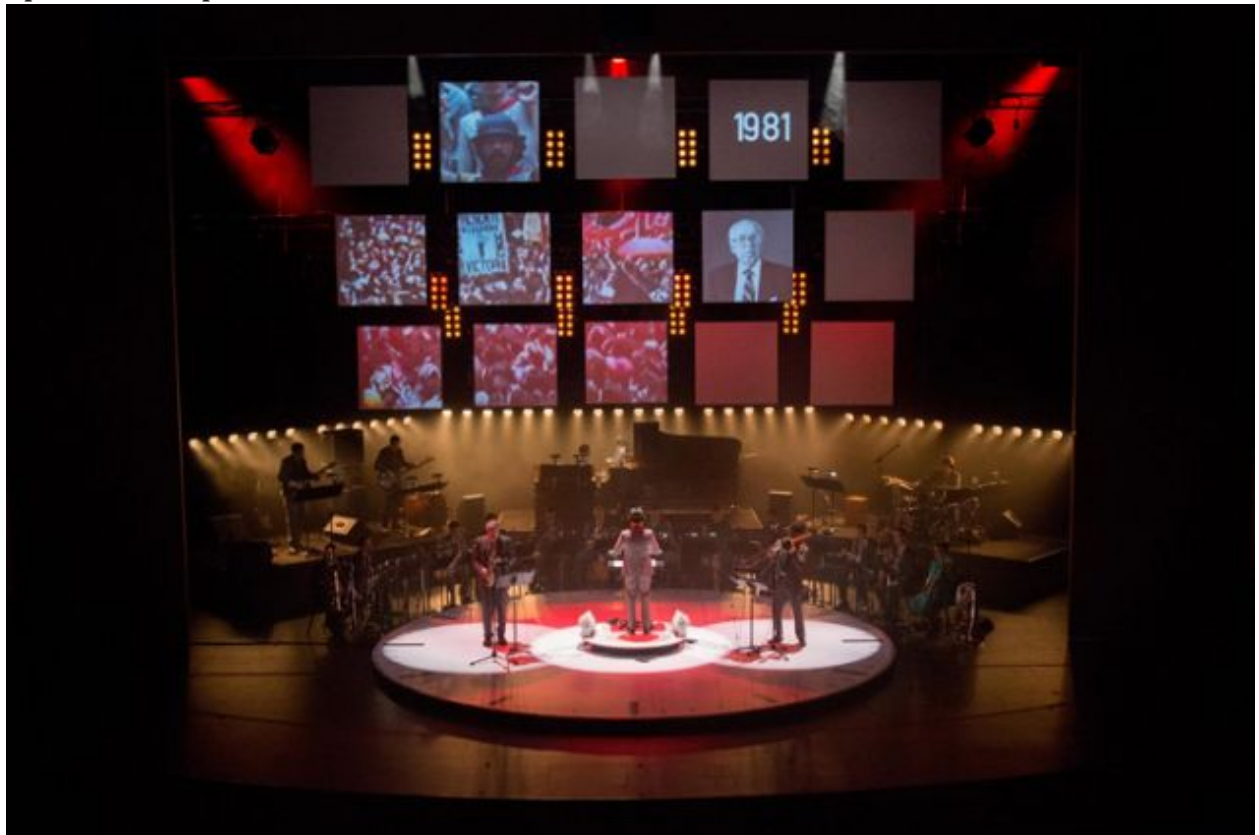
Real Enemies.

Whitney Museum, 99 Gansevoort Street, New York, 7-11 p.m., by invitation only, opens to the public November 20