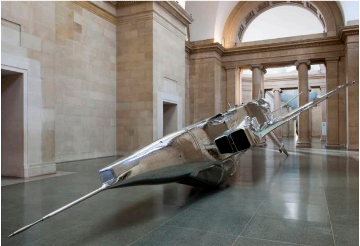
Fiona Banner, Harrier , 2010.