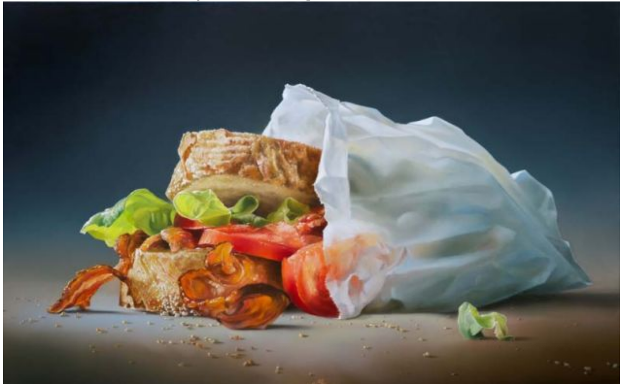
Tjalf Sparnaay, BLT Sandwich , 2015.

New Museum, 235 Bowery, New York 7 p.m., $10