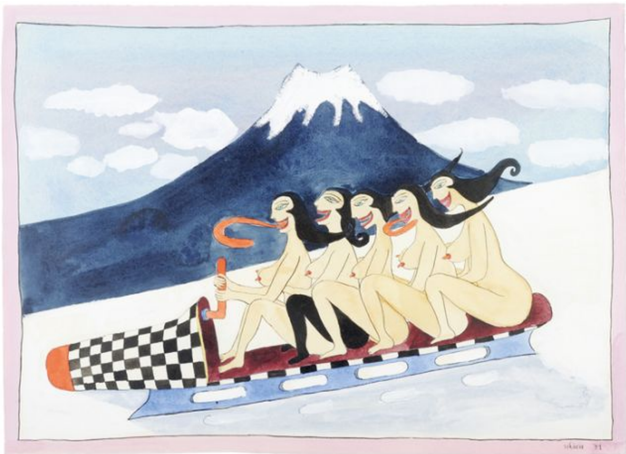
Hans Schärer, Untitled (Schlittenfahrt) , 1971.