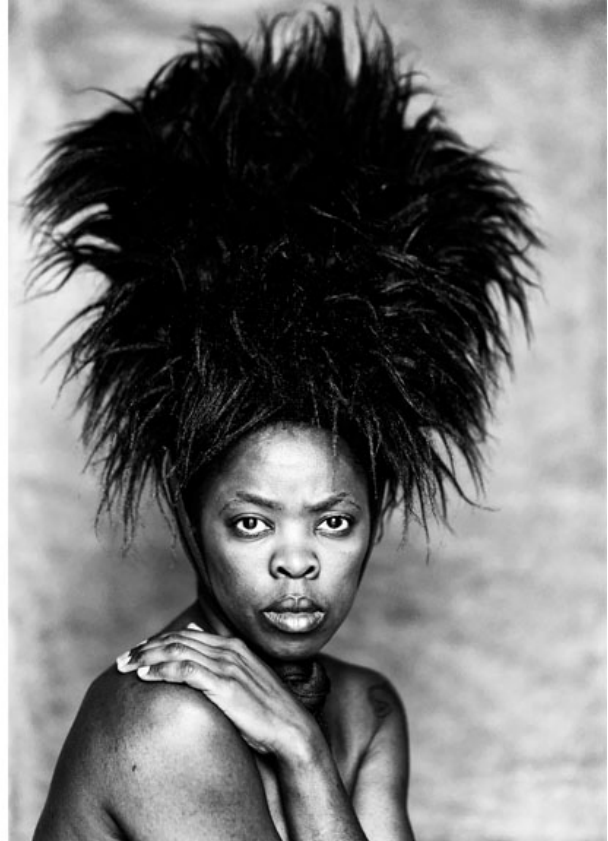
Left: Roe Ethridge – Me and Auggie, 2015. Dye sublimation print on aluminum, 45 x 30 inches. / Right: Zanele Muholi – Bester II, Paris, 2014.