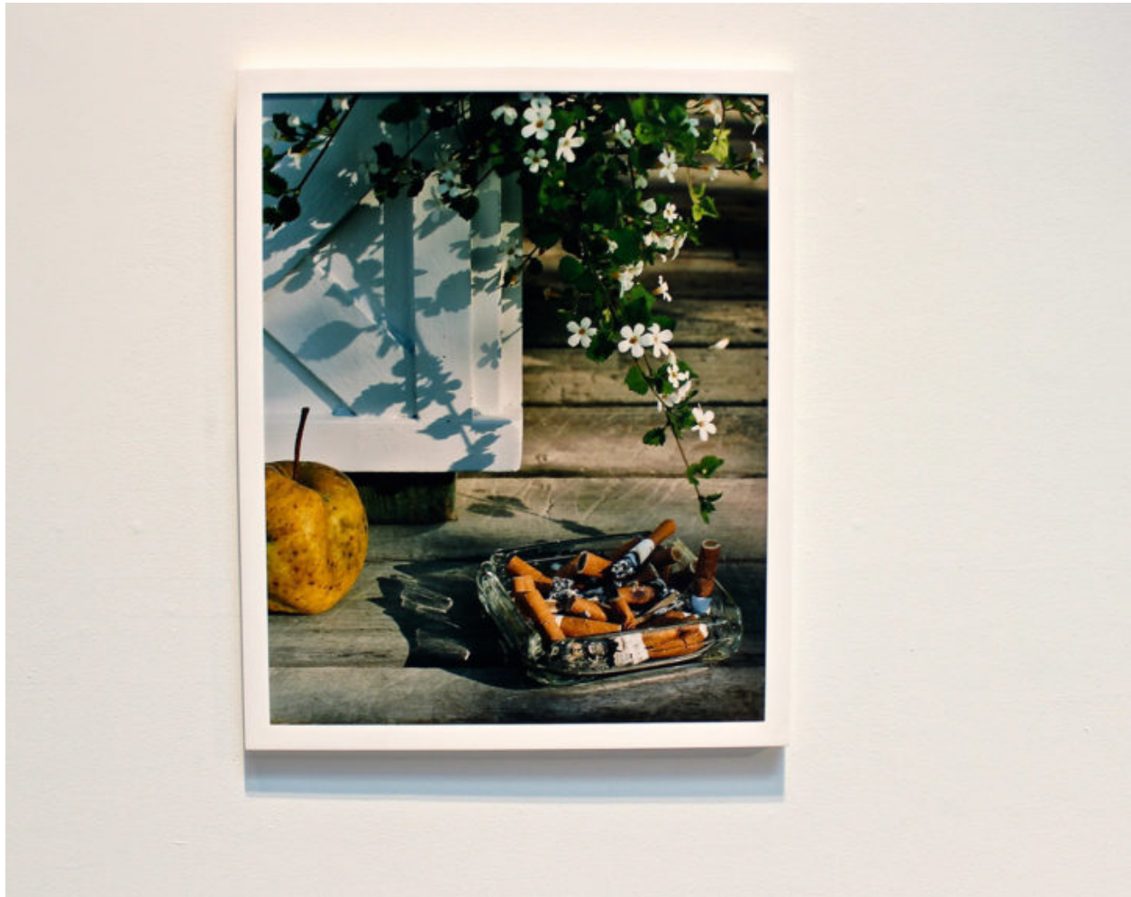
Roe Ethridge, “Apple and Cigarettes” (2004–06)

accept our own internal leaps of intuition and logic; yet throughout his work there is an unshakable sense of tampering, of mediation, of manipulation. Ethridge frequently collects his exhibitions into art-book form, creating open-ended photo narratives offered entirely without text; it would be interesting to generate tags to enable the sorting of his image inventory (e.g. “pearls and melting brie,” “blonde with affected posture,” “redhead smokes marijuana from wooden pipe”). To be as widely applicable as possible, stock imagery must necessarily be vague and open to interpretation. Ethridge’s ability to convert the most intimate details of his own life into such generic terms and “near neighbors” — so close, but so unreal — is, in the end, the most Lynchian aspect of all.