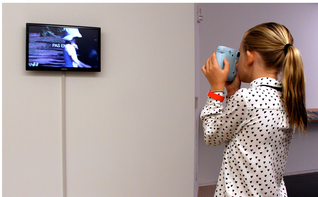
One of the Ethridge children documenting a document of herself

In the exhibition, shots like these, which are produced in a controlled studio environment, are disrupted by candid counterpoints — for example, "Durango in the Canal, Belle Glade, FL" (2011), a photograph of a rental car that ended up underwater after being left momentarily unattended by Ethridge. The multilevel layout and the CAC's odd, Escheresque floor plan lend themselves to an interpretation of the exhibition as a walk through Ethridge's psyche: the wide-open ground floor is dominated by more polished works, glossy and accessible; the upper floors feature sculptural elements interspersed with domestic imagery, as the architecture fragments into a sequence of intimate, telescoping galleries.