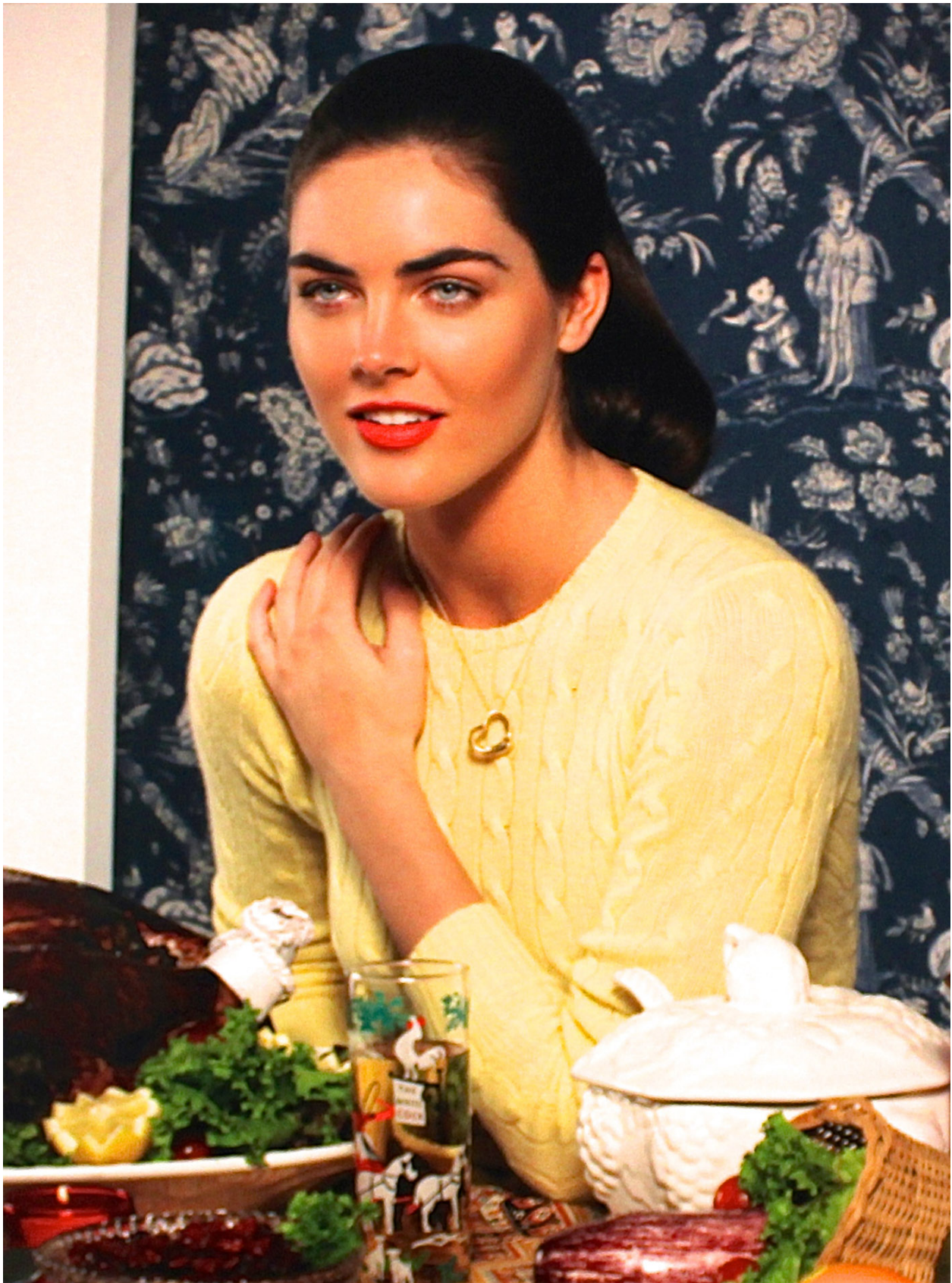
Roe Ethridge, detail of "Thanksgiving 1984" (2009)

"A publication asked me to make a picture of Thanksgiving, and I remembered Thanksgiving, 1984, when my aunt and uncle and cousins came to Atlanta, from Tallahassee," said Etheridge during the opening night panel. "A female cousin was, like,