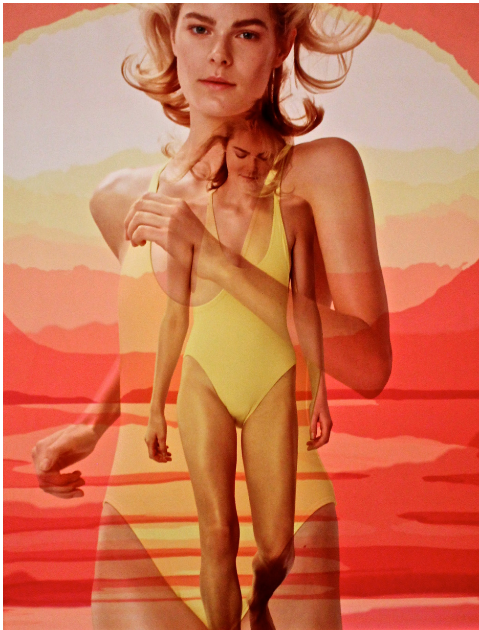
Roe Ethridge, detail of "Double Jess Gold" (2015)