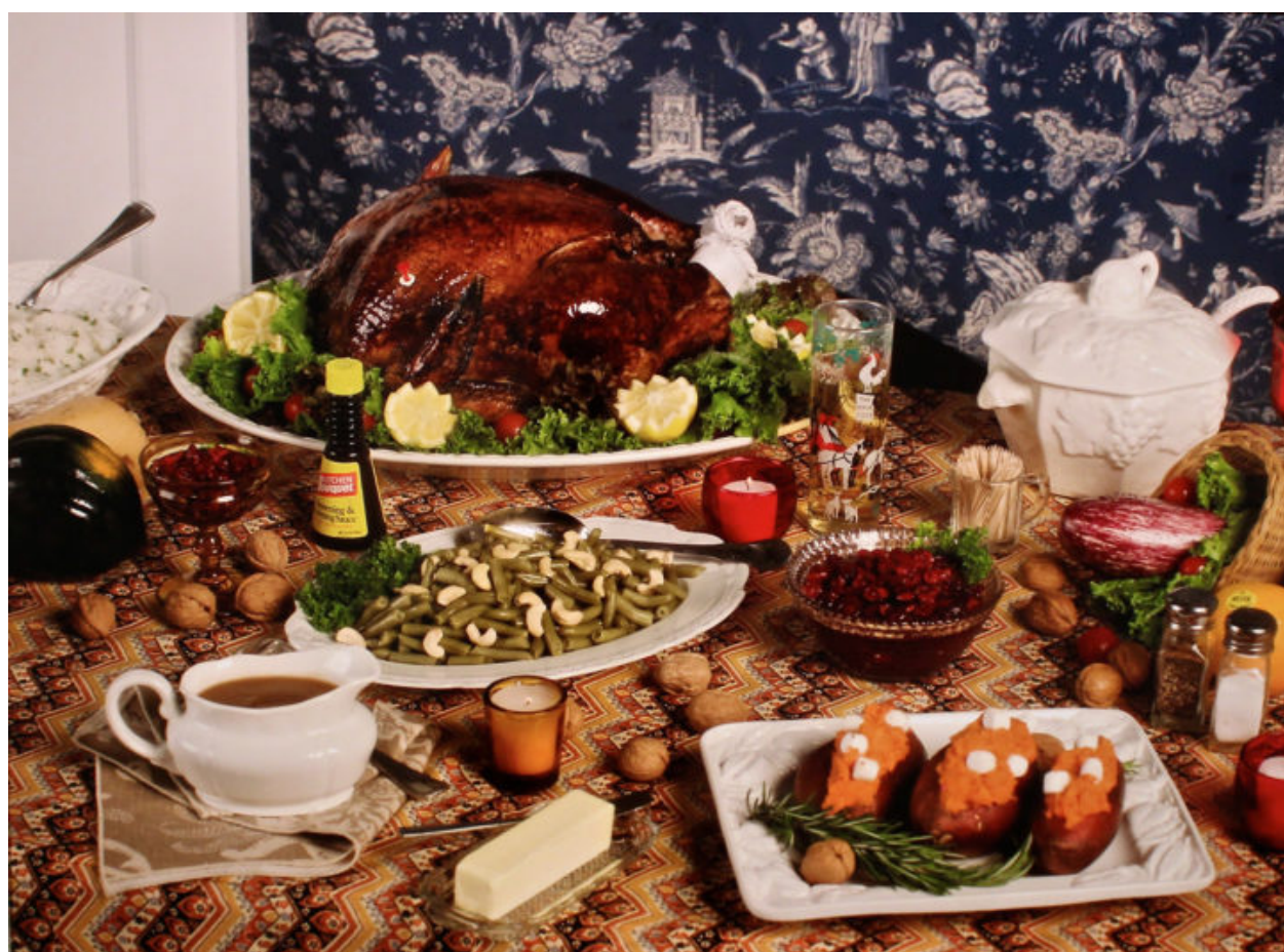
Roe Ethridge, detail of "Thanksgiving 1984 (table)" (2009)

Whether as a function of his commercial photography practice or the selfsame aesthetic that drives it, Ethridge's work has the feel of stock imagery — if David Lynch were to curate a portfolio for Getty Images. A glamour shot of Chanel No. 5 perfume, with a yellow jacket perched just in front of the bottle at image center; Parker in a striped and collared shirt, her icy, Teutonic features obscured by a fleshy-looking bubble of gum; two action shots of pigeons in mid-flight; a pair of images titled "Thanksgiving 1984" (2009) that captures an oddly stiff, nearly Technicolor, and intensely retrograde portrait of domestic celebration. "Thanksgiving 1984" stands as a midpoint in this mid-career survey, which includes sculptural and photographic works from 1999 through 2016; these two pictures, of a garishly perfect holiday dinner spread and an eerily Stepford-like teenage girl at the table, are a neat case study in the Lynchian aspects underpinning Ethridge's compositions.