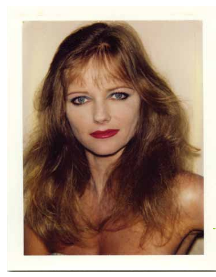
Image Machine: Andy Warhol and Photography Many of Andy Warhol's most recognizable pieces—prints of Marilyn Monroe or paintings of Campbell's Soup—used photographs as source material. But only recently has Warhol been recognized for his own stark photographic work. Contemporary Arts Center, Sept 22–Jan 30

For more information, visit fotofocuscincinnati.org