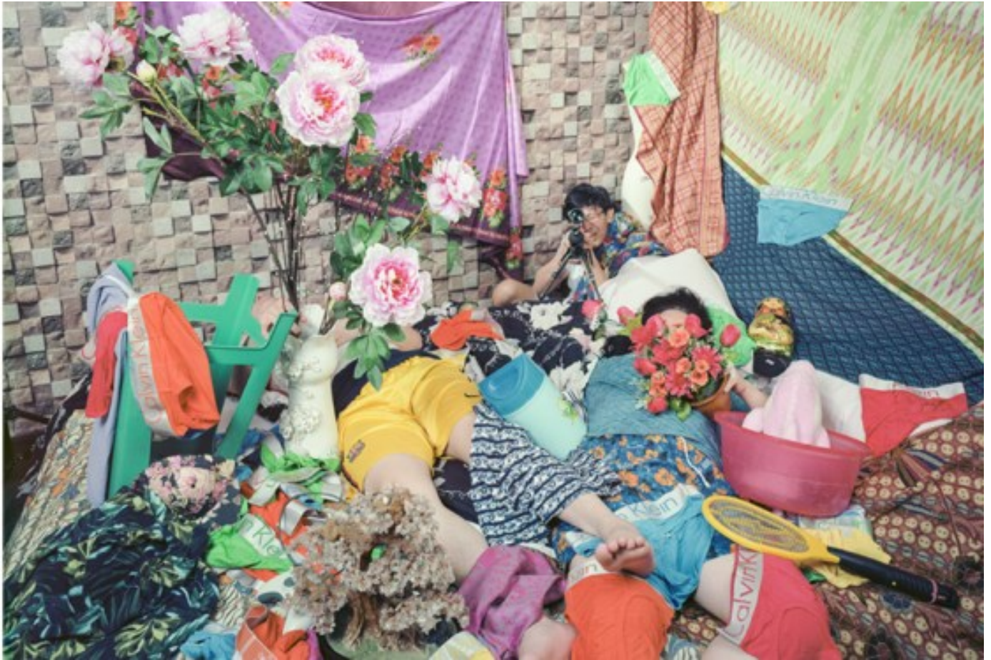
"Calvin," 2016, archival pigment print, 40 x 50 inches, Leonard Suryajaya

Weston Art Gallery, "Material Message: Photographs of Fabric" | Aronoff Center, 650 Walnut St., Cincinnati, OH 45202. 513-977-4165. DETAILS: Photographer Marcella Hackbardt (Mount Vernon, OH) returns to the Weston to curate a group exhibition of photographers responding to fabric's aesthetic, formal and conceptual potential. Runs through June 26.