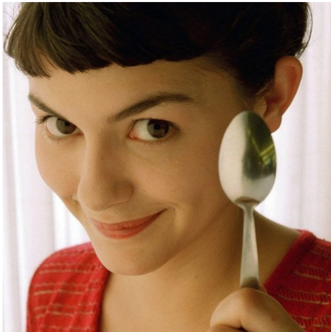
Audrey Tatou as "Amélie"