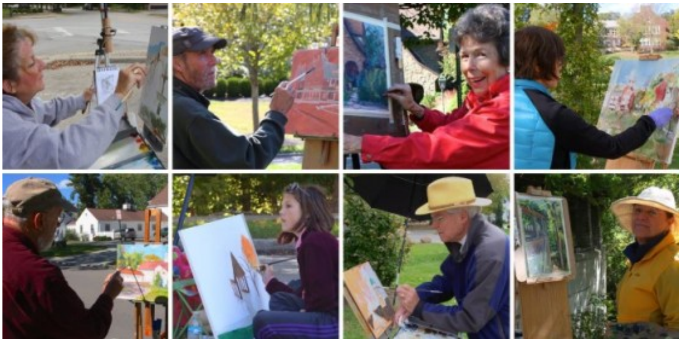
Plein air painters from previous years