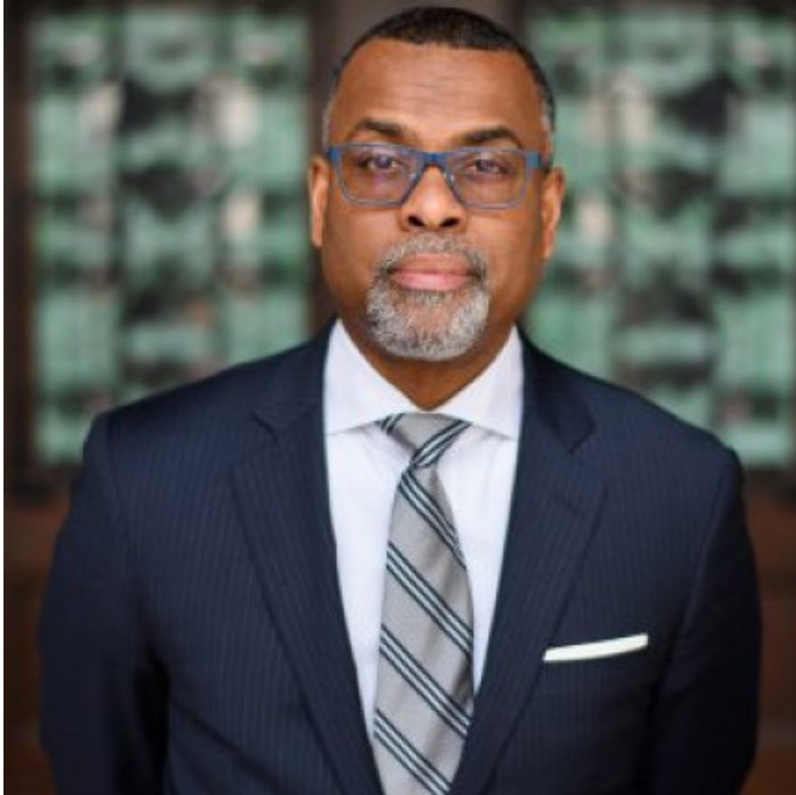
Eddie S. Glaude Jr.