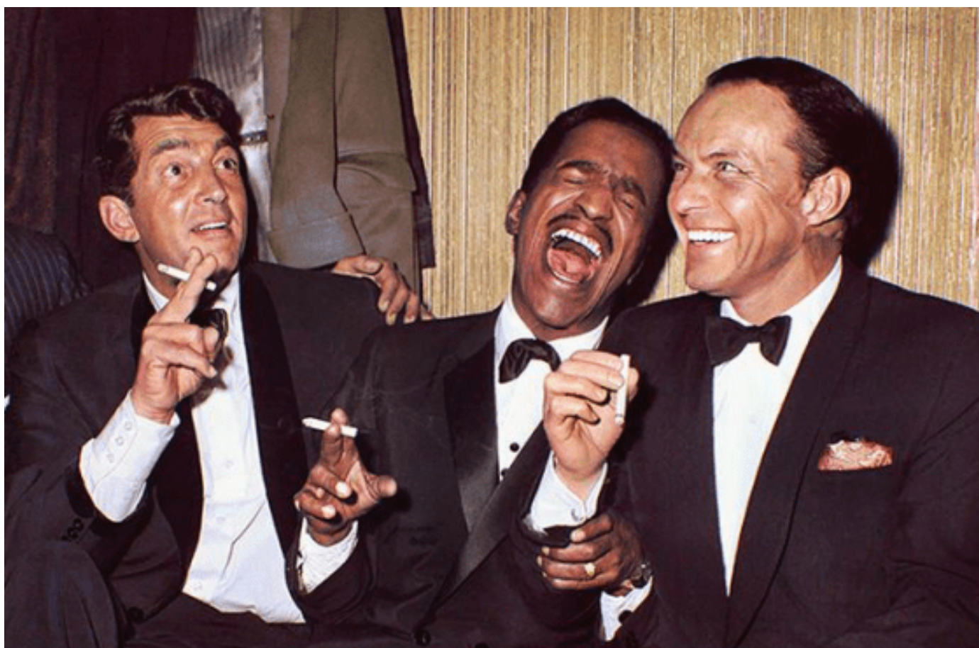
Dean, Sammy and Frank