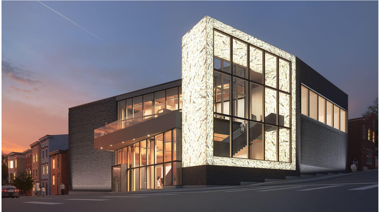
Rendering of FotoFocus Center. Courtesy of JOSE GARCIA DESIGN + CONSTRUCTION

Inaugural FotoFocus Center Marks Major New Chapter for the Nonprofit Dedicated to Championing Photography and Lens-Based Art