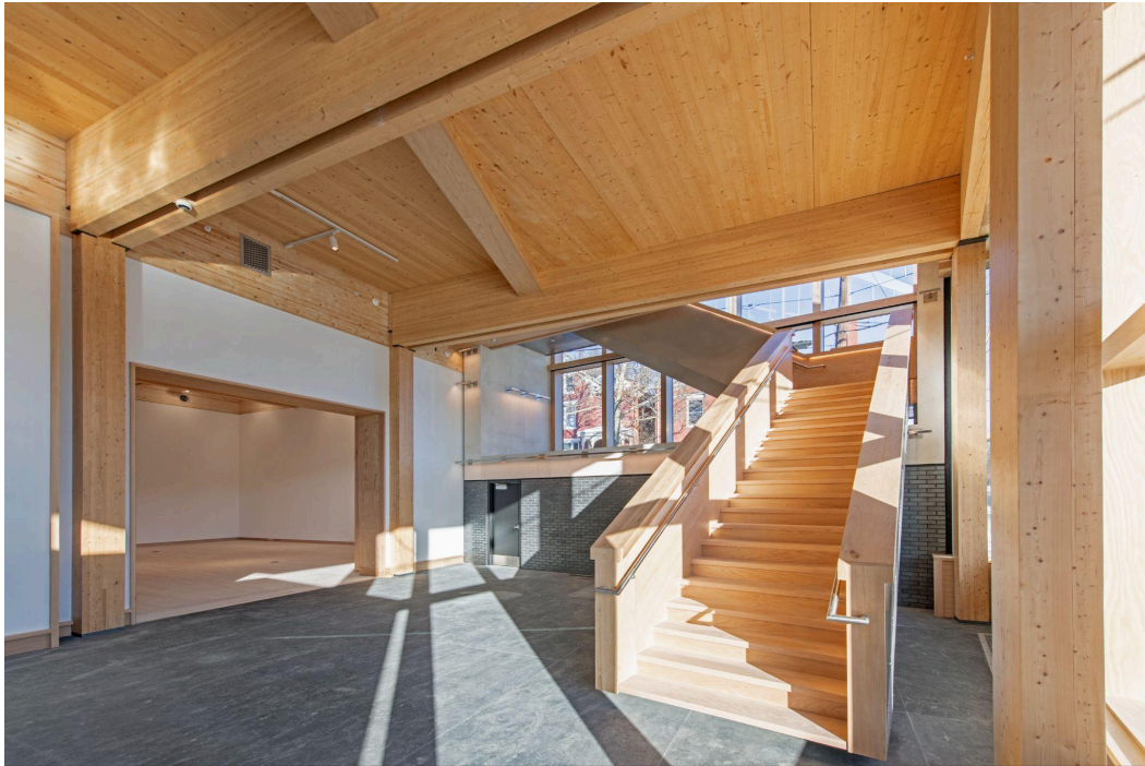
FotoFocus Center.

FotoFocus Center is designed by local architecture studio JOSE GARCIA DESIGN + CONSTRUCTION in the Mount Auburn neighborhood of Cincinnati, located at the northwest corner of Liberty and Sycamore Streets. Free and open to the public, the new facility embodies the core tenets of FotoFocus as it is both forward-facing and reflective. Through Garcia's inspired use of materials, several features nod towards historical architecture prevalent within the area with a contemporary interpretation, such as the usage of corbelled brick and factory-style windows. Additional features speak directly to the photographic medium, such as how from west to east the material choices shift from black to white, and the staircase feature, with its gridded windows, alludes to a viewfinder camera, while all windows allow ample light—a critical component of photography—to fill the public lobby spaces.