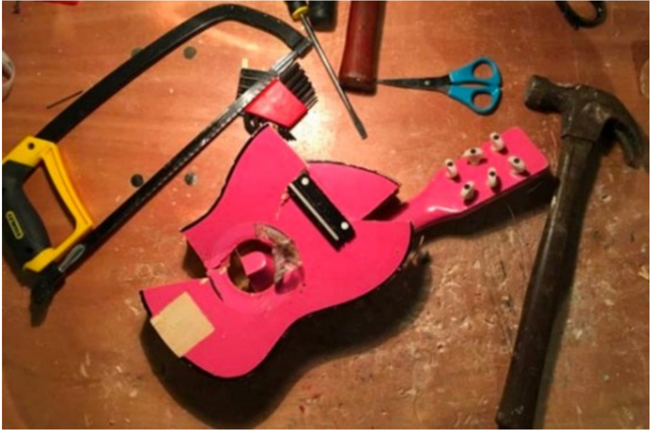
This Time Tomorrow

Contemporary Arts Center, “This Time Tomorrow” | Various locations and virtual. DETAILS: Performance and visual art festival returns with in-person and virtual events. Read our event preview . Runs through Sunday.